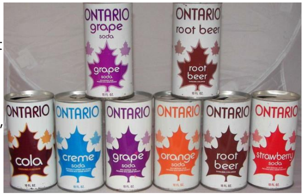
Above: Known Ontario 10oz cans Below Left: The LaGrape and Pop Rouge 10oz cans

The most common is probably the Ontario cans - in all, there are 8 different cans representing two different generations. The large leaf variety has 6 known flavors (cola, cream, grape, orange, root beer and strawberry), while the small leaf variety has only been identified in grape and root beer... so far!